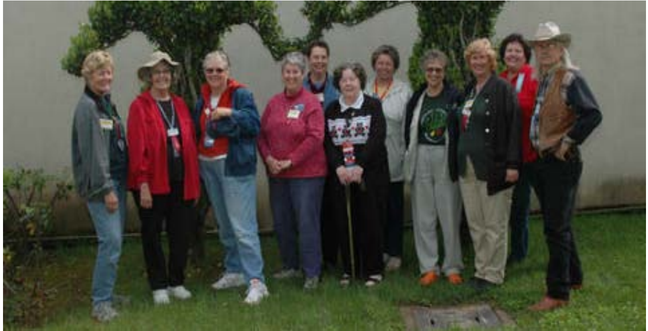
First Penwheels SKP BOF meeting