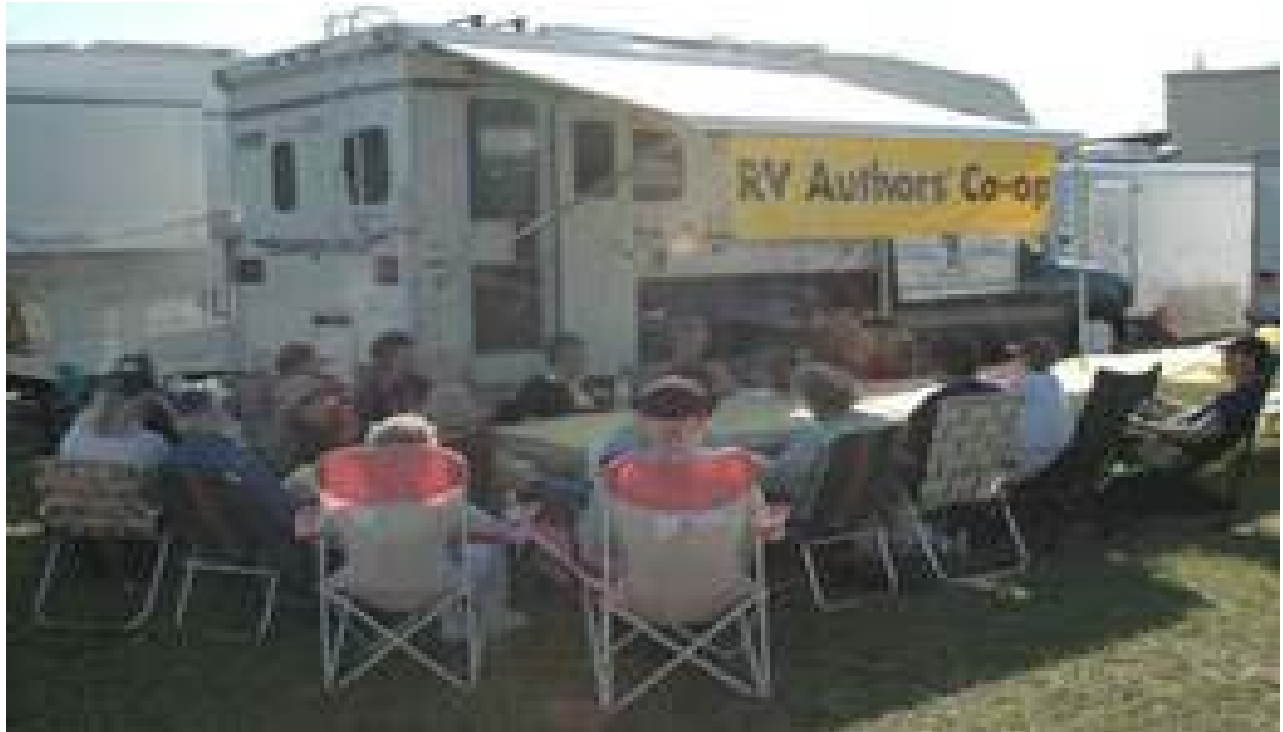
Second Penwheels SKP BOF meeting